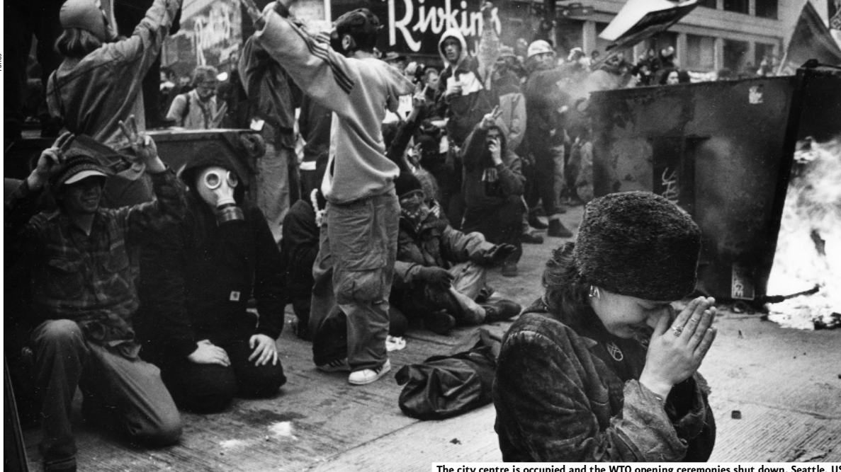
The city centre is occupied and the WTO opening ceremonies shut down. Seattle, US

market' zone. In Italy a McDonald's is occupied, a Nestlé factory and Lloyd's Bank get similar treatment in England, while 2,000 people rally in London against the privatization of public transport and are attacked by the police.