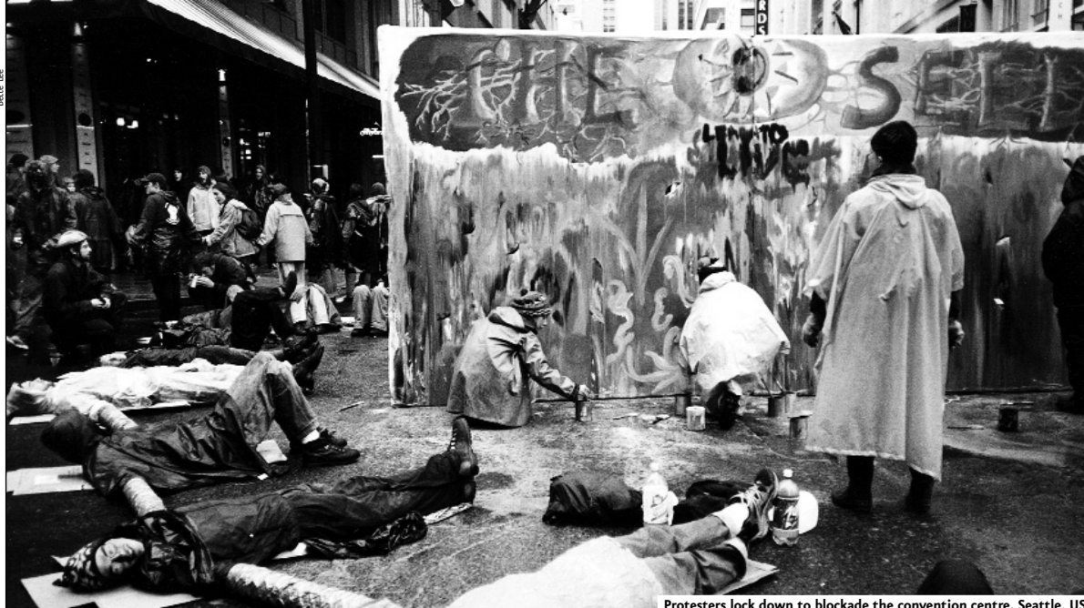
Protesters lock down to blockade the convention centre. Seattle, US

streets of Seattle, the unruly forces of democracy collided with the elite world of trade policy. And when the meeting ended in failure on Friday, the elitists had lost and the debate had changed forever." While activists in Seattle bring the city to a standstill, internet surfers from around the globe are able to log onto a special website, courtesy of US hacktivists armed with scanners, that broadcasts the