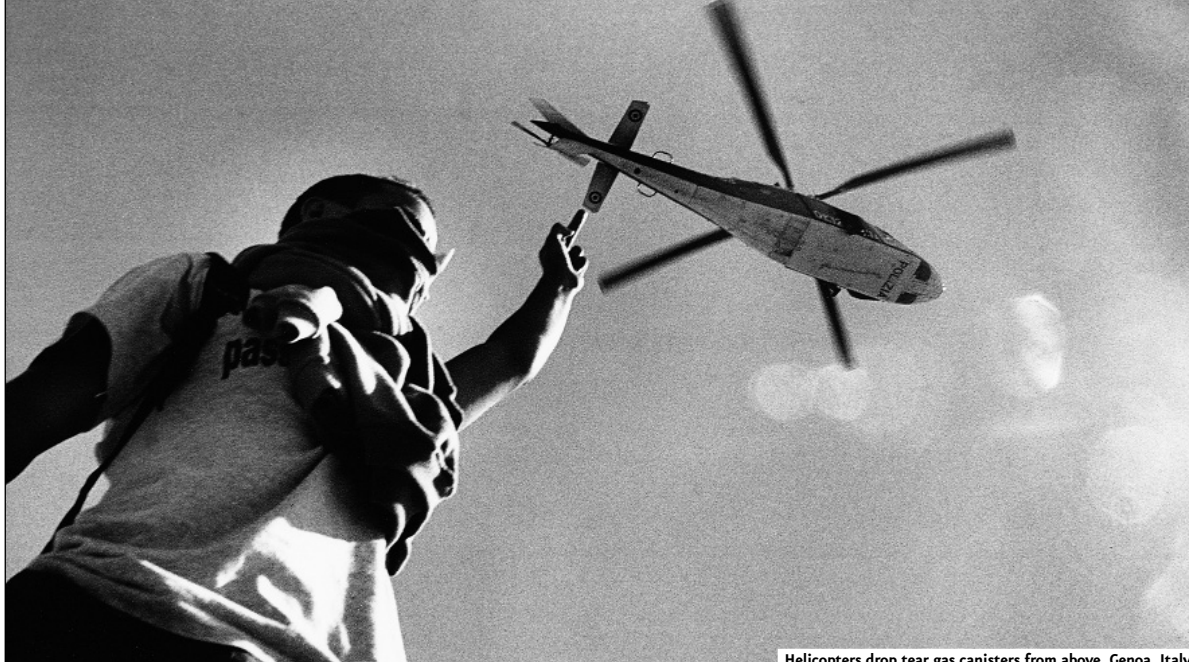
Helicopters drop tear gas canisters from above. Genoa, Italy