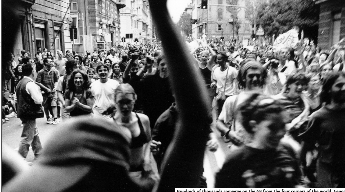
Hundreds of thousands converge on the G8 from the four corners of the world. Genoa

For over a month, and all around the world, Italian embassies and consulates are targeted in a variety of ways as the most tangible symbol of the murderous Italian state, and the focus of much rage and mourning. Memorials to Giuliani are constructed, red paint is splashed and red wine dumped, slogans are spray painted in Italian and local languages, paint bombs, rocks, and underpants are thrown at the windows, and