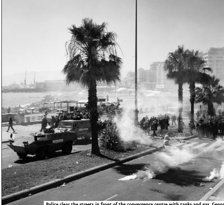
Police clear the streets in front of the convergence centre with tanks and gas. Genoa